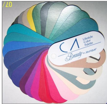
Life Style Color Palette with 40 top colors