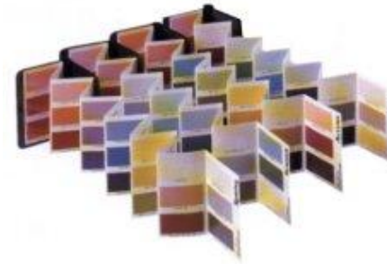
Color Wallet with your 36 top colors