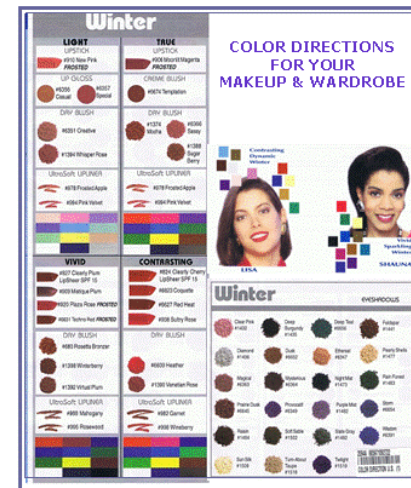
Color Directions for your makeup & wardrobe