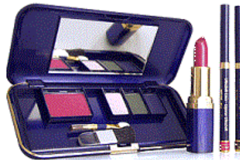
Vicky's Color Directions For Contrasting Exotic Winter

Cool deep, bright, saturated makeup colors look fantastic on Vicky's face.