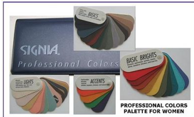
Professional Color Palette – your best 40 colors that organized to build your wardrobe